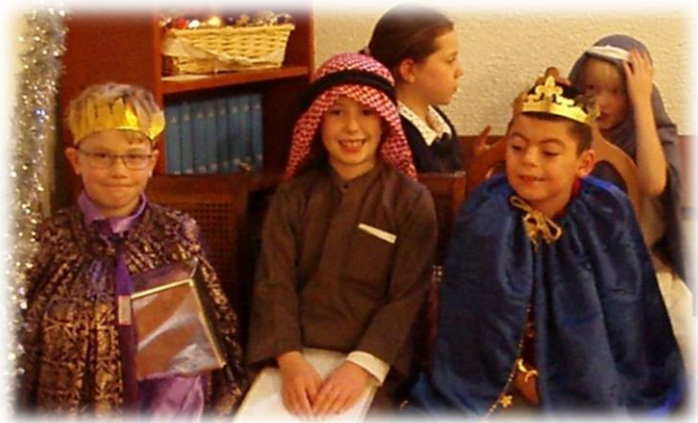
Gingins Nativity Service