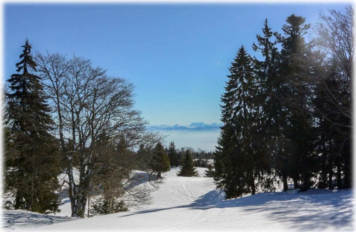
La Côte from the Jura

Christian communities in Gingins and Divonne