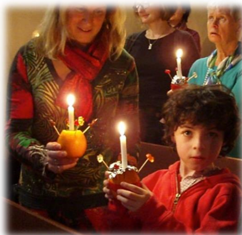
Christingle Service at Gingins