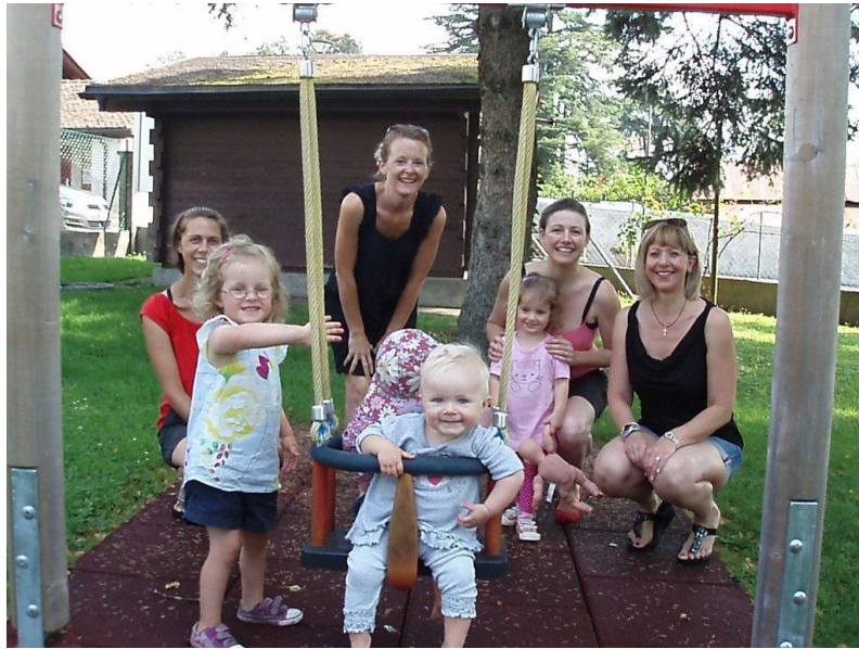
Cake and Catchup Group - Gingins. See the Bulletin for details of meetings.