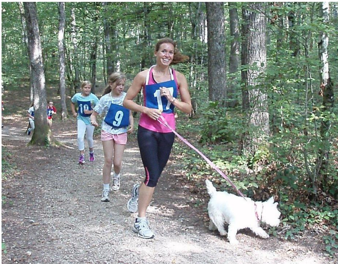
Running for La Côte!