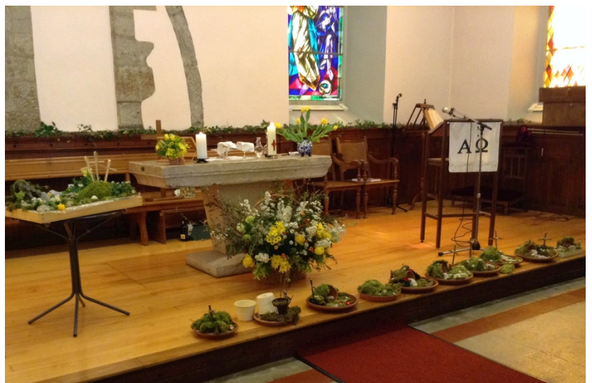
Jane shows off her Easter Garden before the service