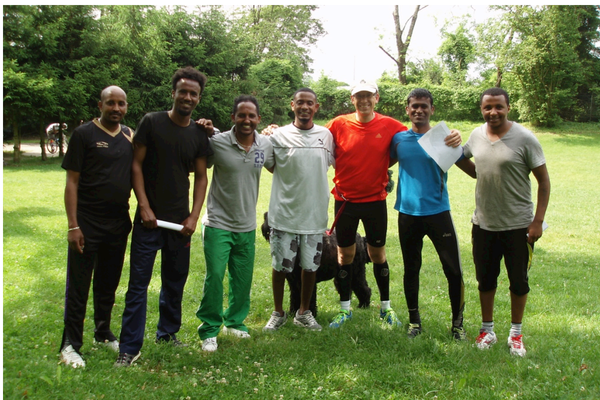
Social Action Fundraising at La Côte