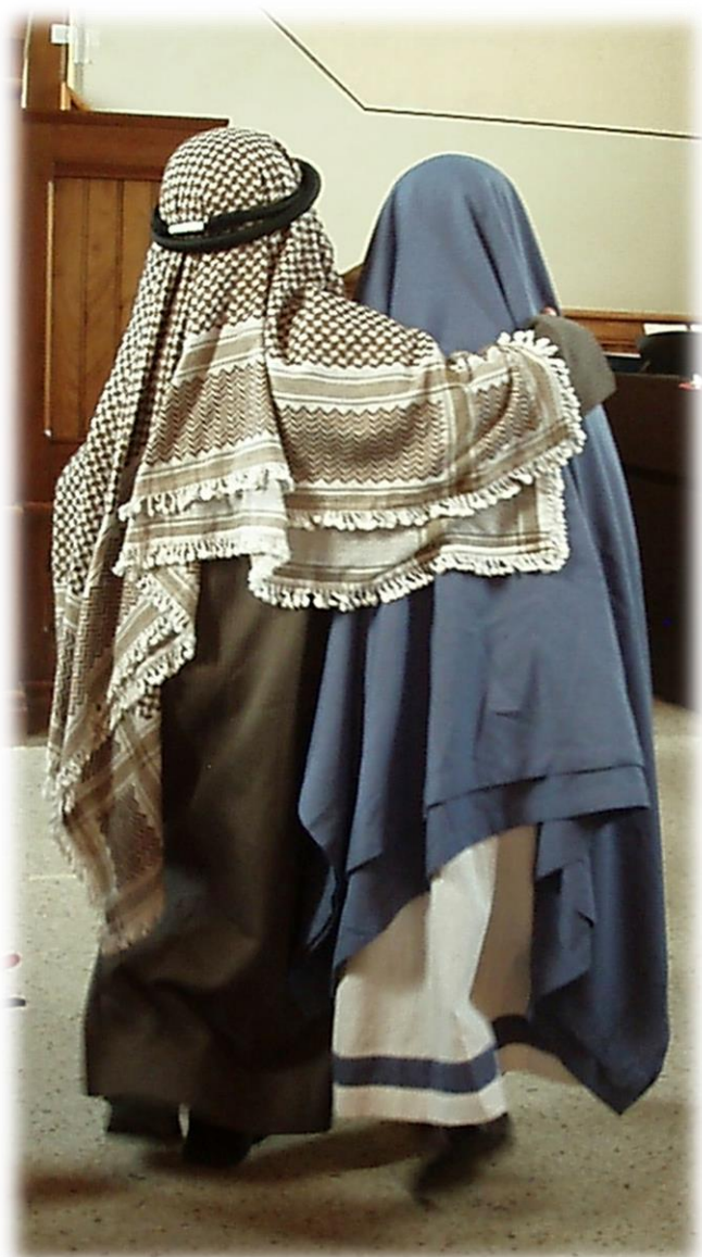
Advent at La Côte