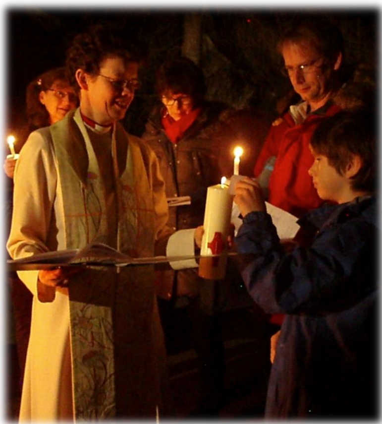
Easter sunrise service 2016