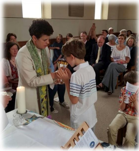
First communion in June at Divonne