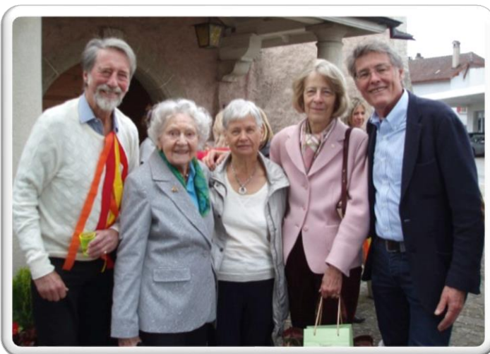
(partially based on an article printed in La Côte Anglican Church Newsletter Dec/Jan 2008/9)