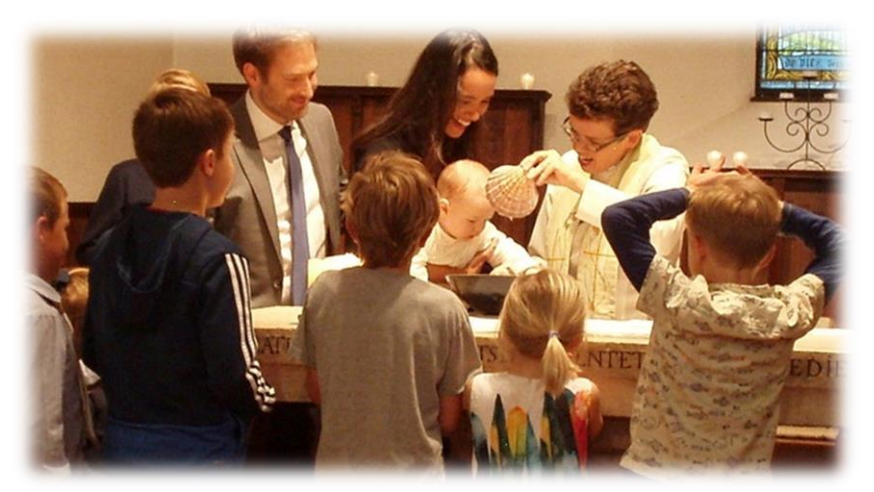
Baptisms at Gingins 29 October 2017