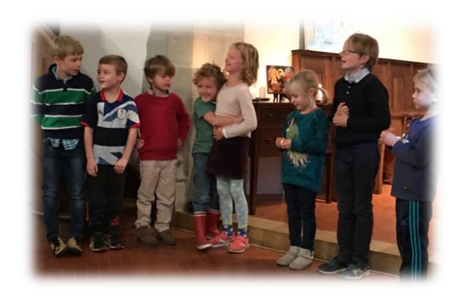
Celebration in June (left) and November (above)