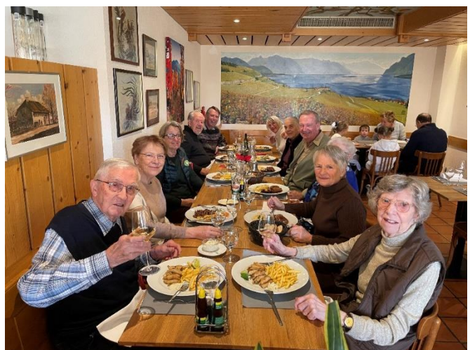
Sunday lunch at the Auberge de Coinsins