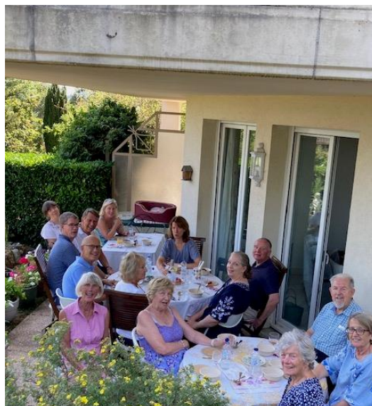
La Côte song group summer practice and barbecue, August 2023