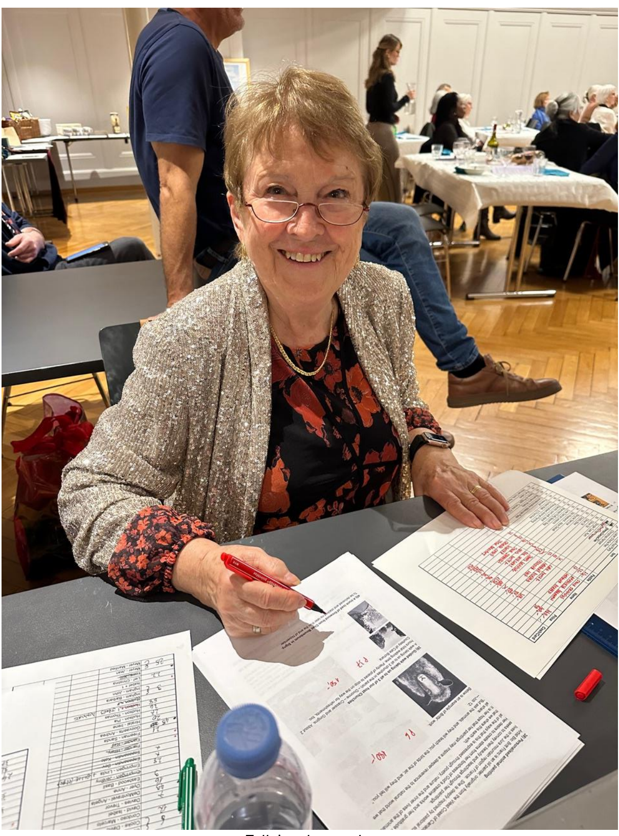
Tallying the results

La Côte Auction of Time and Talents (26 October,) an evening of much laughter and relaxed socialising with a range of tasty curries and crumbles and a generous community spirit offering both talents and time – and bidding for them!