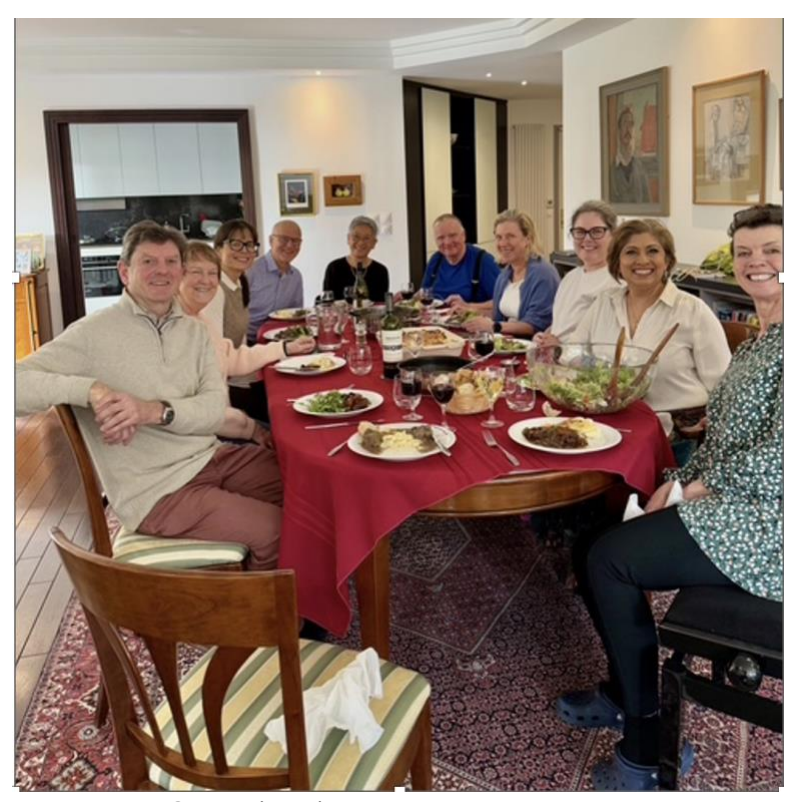
Council quiet day 25 January 2025