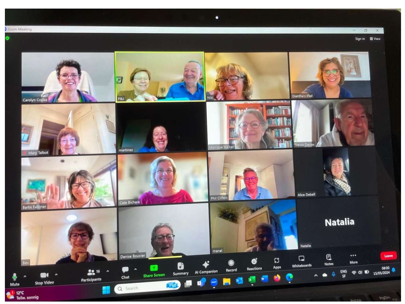
Participants in Morning Prayer, 15 May 2024