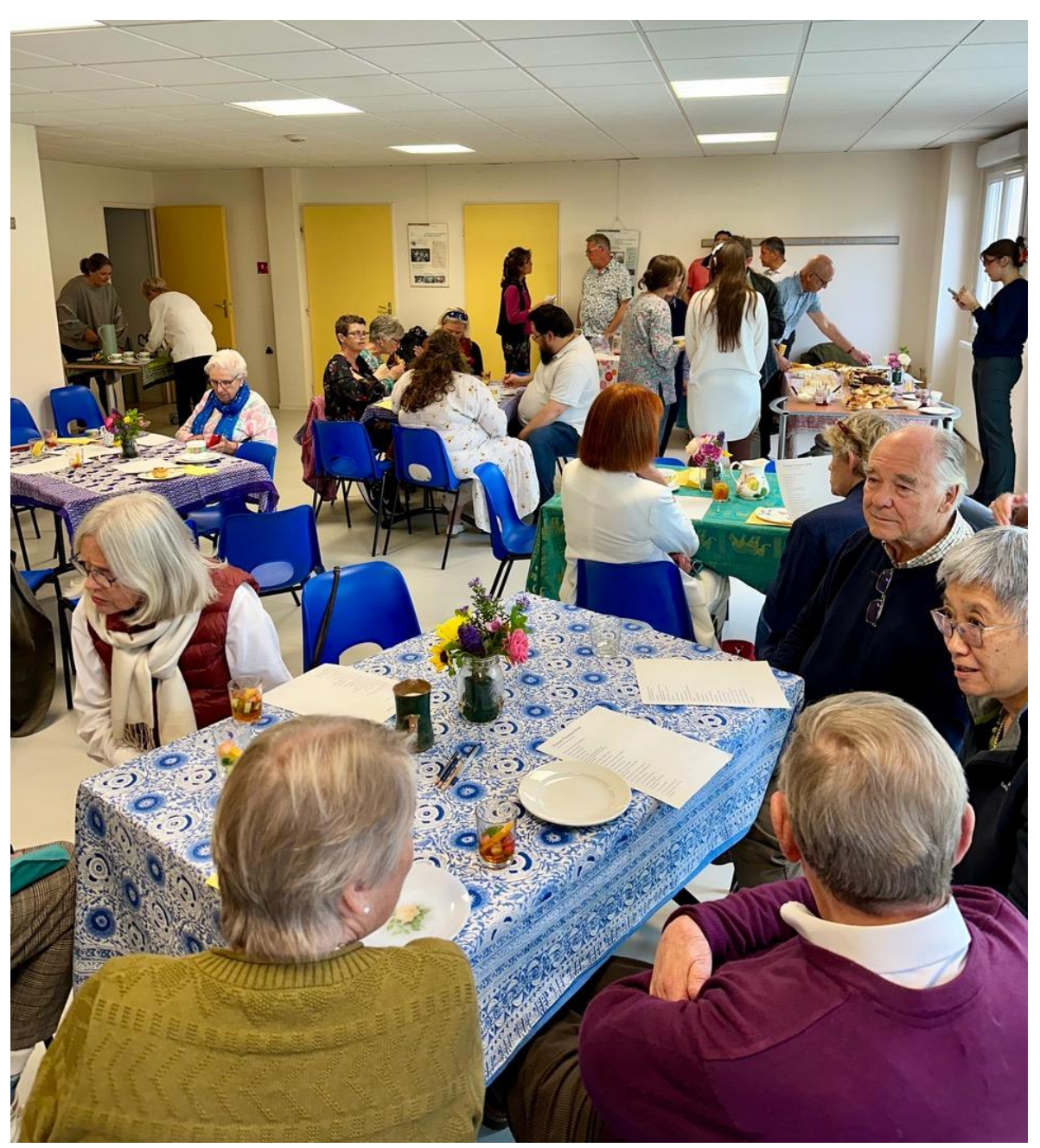
The cucumber sandwiches went down very well

Divonne Tea Party (28 September), gathering about 40 members of our church for an enjoyable afternoon tea with a delicious spread and Pimm's as well as hot beverages.