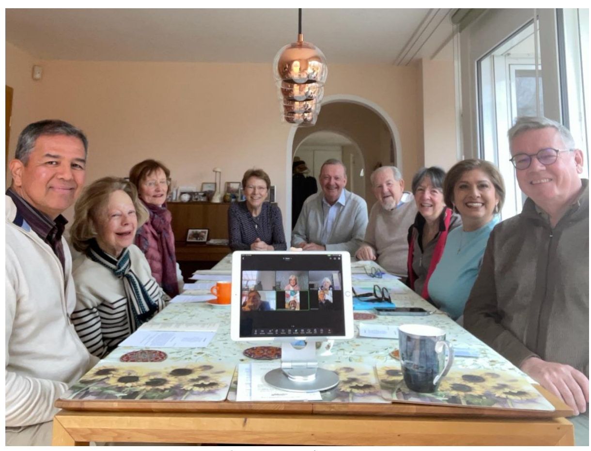
A Prayer Group gathering, January 2024

Believing that prayer is at the heart of our community, not just on Sundays but throughout the week, we trust that these meetings provide a haven of hope in these challenging times. All are welcome to join us, either occasionally or regularly, or to send us prayer requests in confidence.