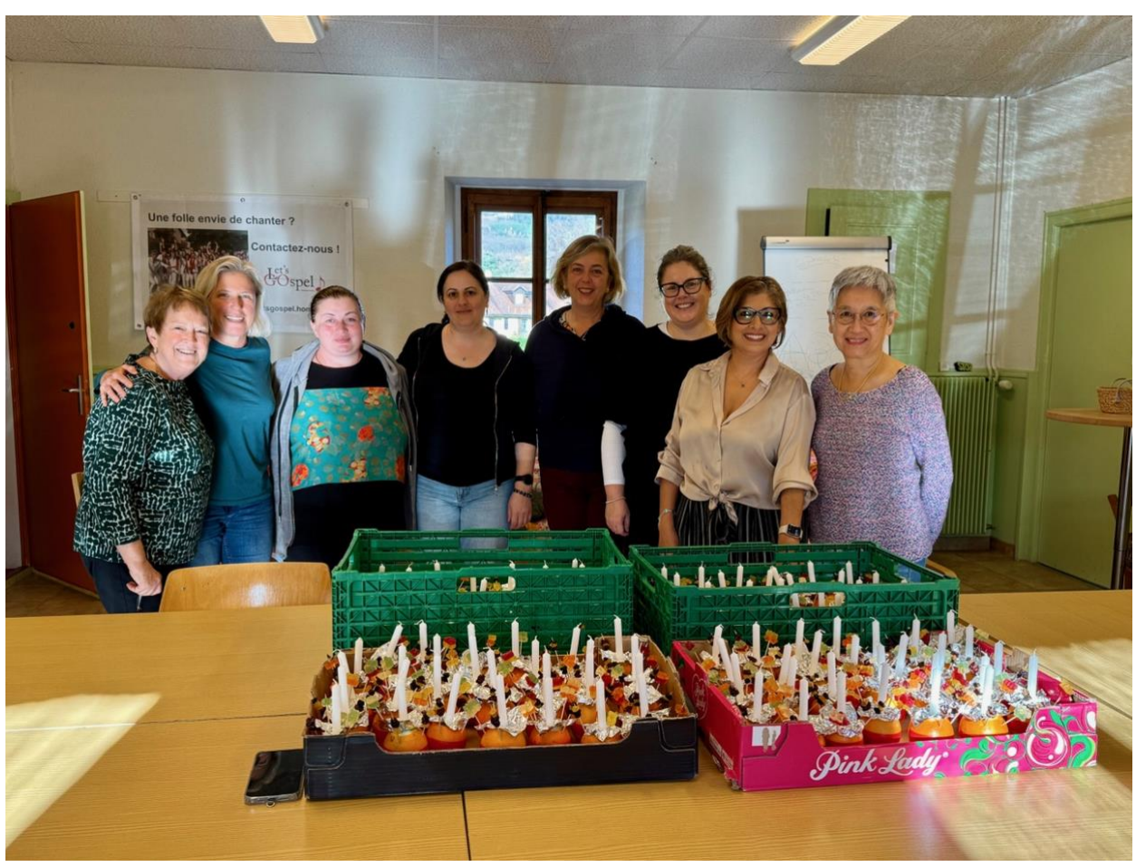
WOW members ++ making Christingles, December 2024