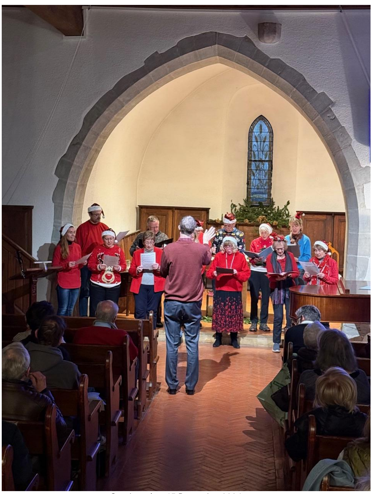
Carol service, 15 December 2024