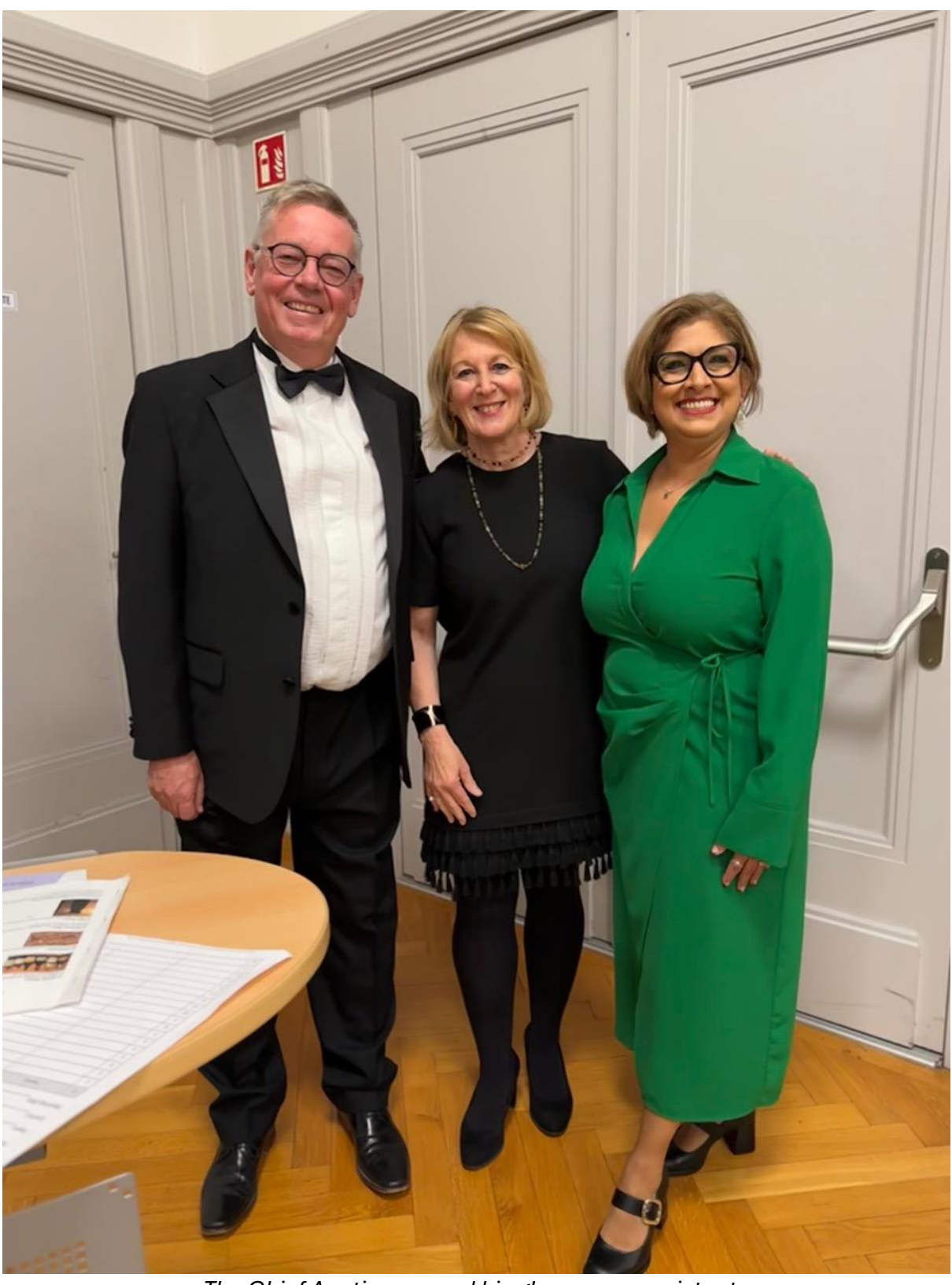
The Chief Auctioneer and his glamorous assistants

Festive Christmas Lunch (8 December) offering a delicious Gravlax salmon lunch, a taxing Christmas quiz and the characteristic chaos of singing and performing "A partridge in a pear tree"!