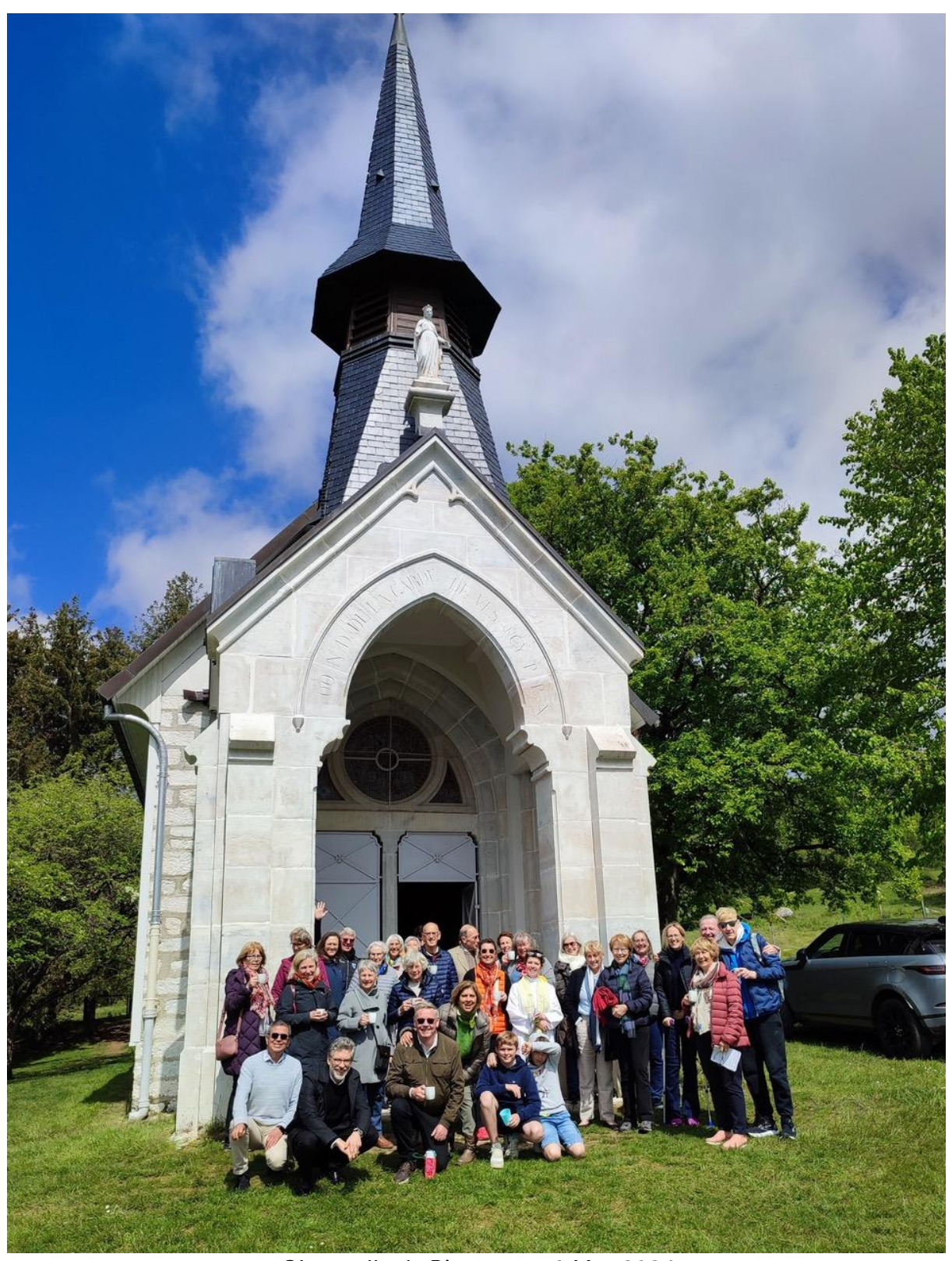
Chappelle de Riantmont, 9 May 2024

Ascension Day (9 May) service in the Chapel of Notre-Dame de Riantmont, Vésancy in France.