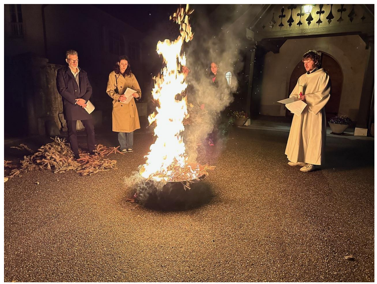
Sunrise service, Easter morning 2024

With our host parish of La Dôle – Pastor Etienne Guilloud continues to be very welcoming and open to joint services and events, such as the 'Blue Christmas' service, early morning Easter Day sunrise service, both in collaboration with Chris Potter, and the current monthly Taizé services.