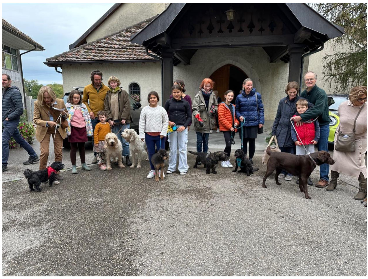
Fantastic beasts and where to find them

Choral Evensong , (29 September) welcoming Holy Trinity Choir to lead our worship with Anglican Choral music