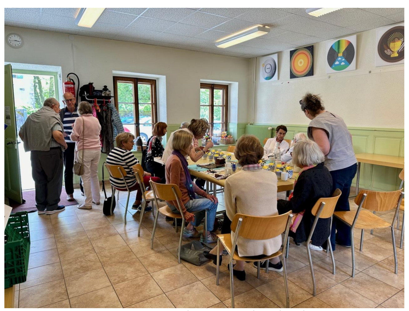
Pastoral care takes place in many forms, including this