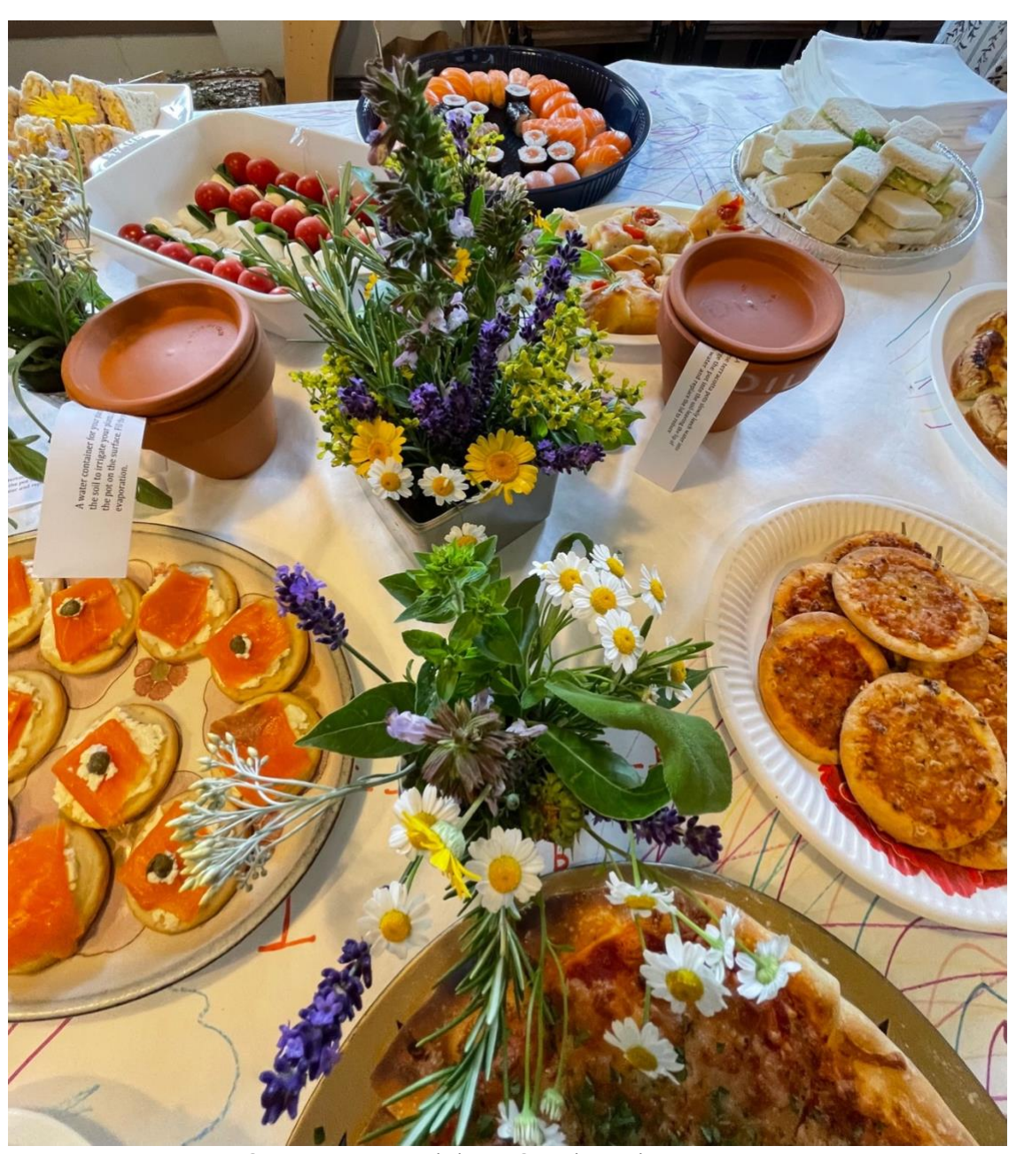
Some of the delicious Confirmation lunch spread